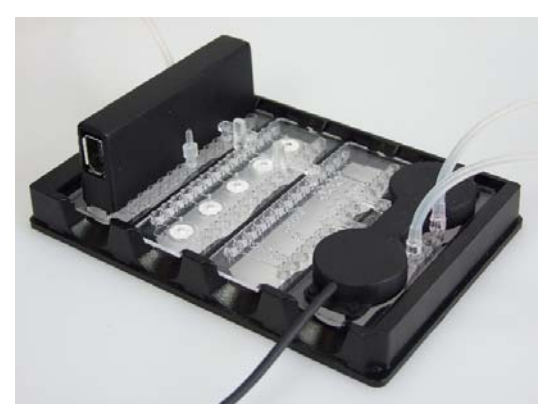
Microfluidic Construction Kit