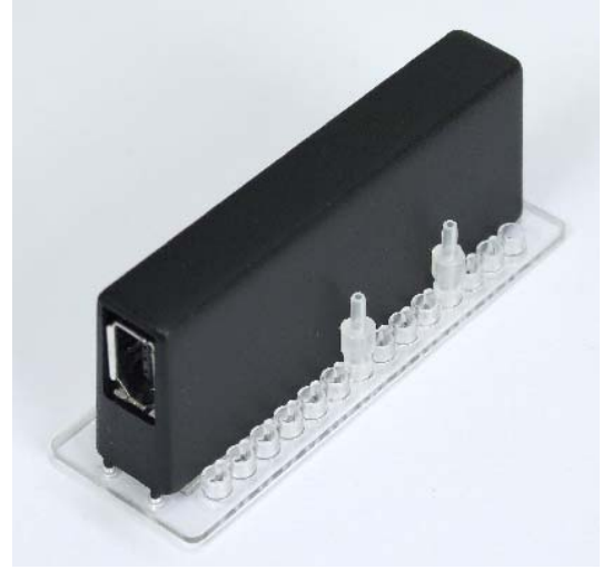
Flow sensor module

The microBUILDER flow sensor module consists of two silicon flow sensor chips, read-out electronics with analogue and digital output and polymer packaging containing standardized fluidic connectors. The module fits into the microBUILDER Microfluidic Construction Kit - a modular platform enabling the easy setup of microfluidic systems by combining available modules, each designed to perform microfluidic operations like pumping, mixing and splitting.